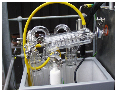
En1948 Pt 1 Sampling Train for Dioxin/Furan Measurements